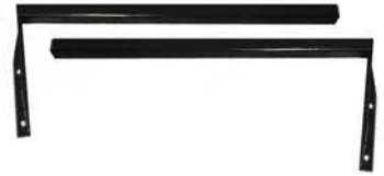
Cargo Box Brackets

1 Using a T45 Torx driver, remove four bolts holding factory bag attachment to rear strut assembly.